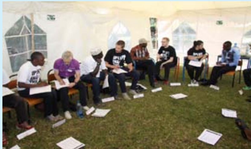
School of Education has won USD 300,000 from USAID to Launch Early Grade Instruction Curriculum