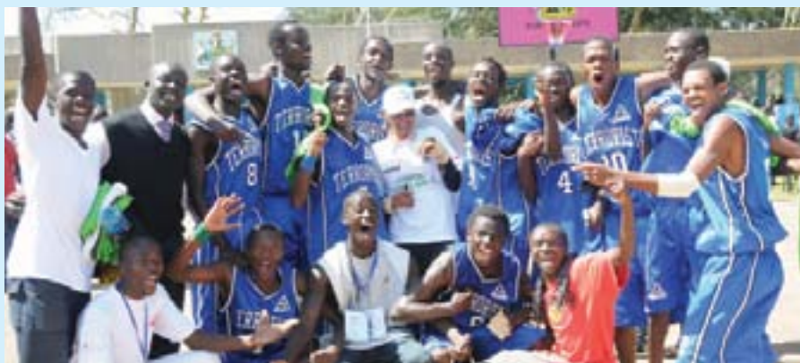
University of Nairobi Basketball Team