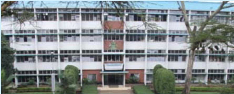
School of Engineering