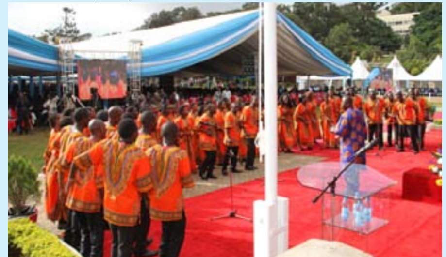
University of Nairobi choir performing during the 56th Graduation Ceremony

Habitat for Humanity Kenya - University of Nairobi Campus Chapter Hindu Students Association Historical Association of Kenya Human Resources Management Students Association Inter-College Environmental Network International Relief Friendship Foundation (IRFF) Japan-Kenya Student Conference of Nairobi Kenya Law Students' Society Kikuyu Kiswahili Club (CHAKIKU) L'afreme - Medical Campus Linguistics Student Society Lions Club of the University of Nairobi Literature Students Association Marketing Students Association Mathematics Association of Nairobi University (MANU) Medical Students Against AIDS Muslim Students Association-E-Mail: msa_un@yahoo.com Nairobi University Actuarial Students Association Nairobi University Agriculture Students Association Nairobi University Association for a Drug Free Society -(NUADS 72 Nairobi University Biochemistry Students Association (NUBSA) Nairobi University Chemical Club Nairobi University Collegiate Association for Research of Principle Nairobi University Computer Science Students Association (NUCOMMSA)