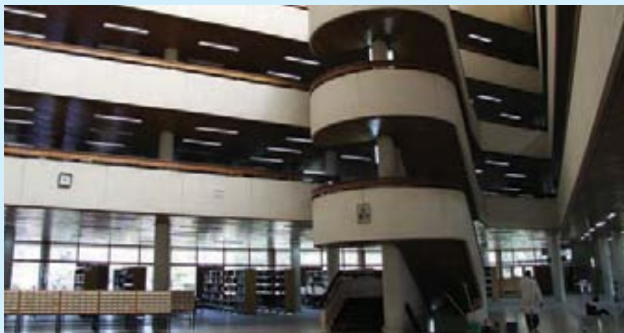
An inside view of JKML Library