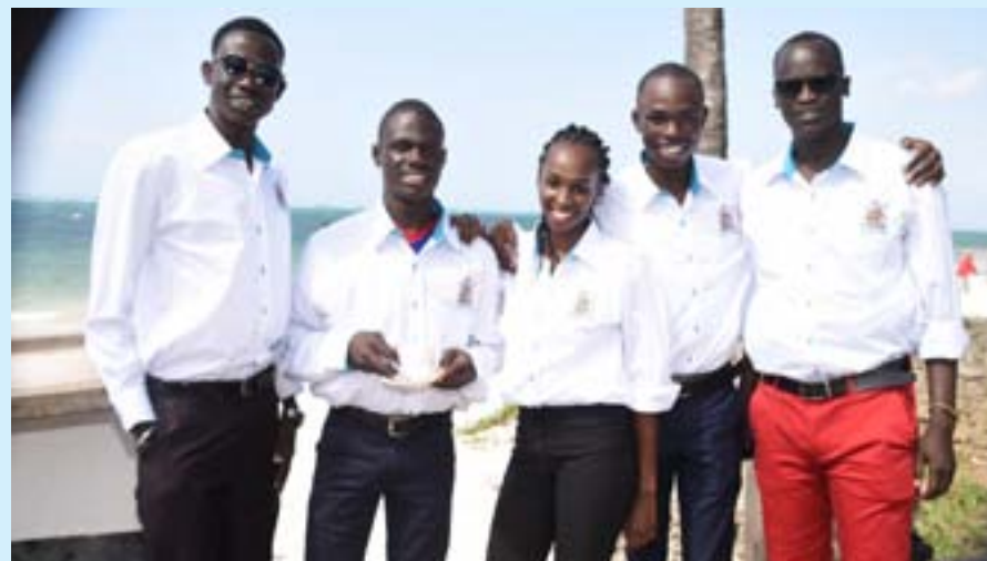
A section of the 2019 Students Organization Leaders (UNSA)

Students are encouraged to participate in extra-curricular activities while at the University. One such outlet is participation in professional associations and clubs. These associations not only address the professional and personal welfare interests of students, but they also provide opportunities for performing community service and personal development. The University has various students bodies, which represent students' interests. Through the various representatives, students access all decision-making levels from the halls, the Senate, and all the way to Council. The University of Nairobi is committed to seeing that student organizations are fiscally able to meet their desired goals and aims. Student Organizations should liaise with Deans of Faculties and Directors of Institutes for further guidance.