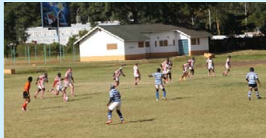
The Mean-Machine University of Nairobi Rugby Team

Basketball men and women always qualify among the top 4 teams in the country that participate in the playoffs for the last 7 years. Mean Machine was the flood light champion in 2006 and runners up in Enterprise Cap in 2007, a league that attracts top clubs in East Africa. Mean Machine has also won 2 Gold Medals and 2 Bronze Medals in the last 3 East African Interuniversity Games editions.