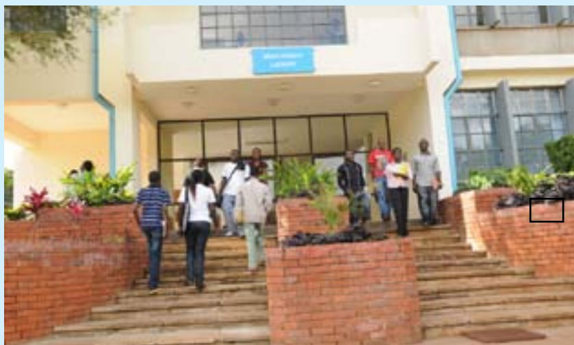
The Mwai Kibaki Library at the Lower Kabete Campus