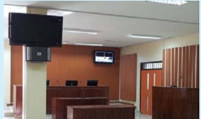
State-of-the-Art Moot Court Facility at the School of Law.