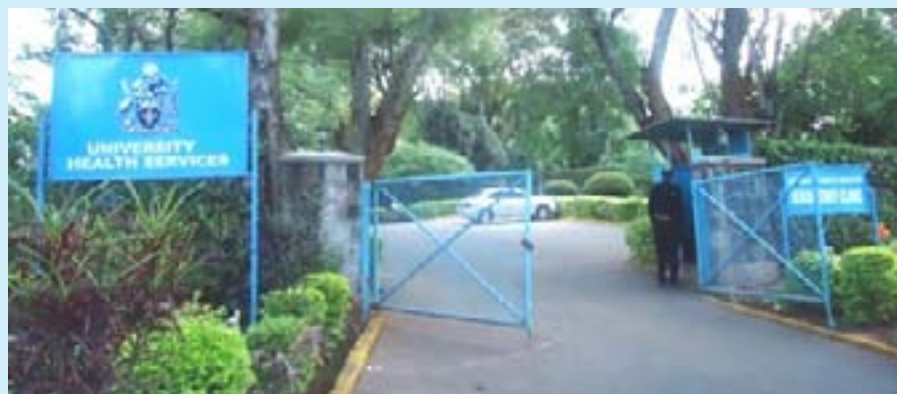
The entrance to the University of Nairobi Health Services Clinic along State House Road

The maternity care provided will exclude delivery, pregnancy related complications and services received from private facilities.