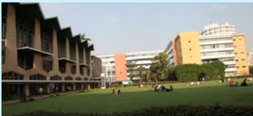
A view of the University of Nairobi Main Campus

Nairobi enjoys a temperate climate. The hottest periods, however, occur between January and March and August and October with the coolest period in July. The long rains fall from the end of March to the end of May while the short rains are experienced from the end of October to December. The average annual rainfall is about 800 centimetres. Nairobi is the capital city and the commercial, administrative and cultural centre of Kenya. In Nairobi are found the Parliament Buildings, Headquarters of Government Ministries and Departments. Also, the city is home to the City Hall, State House, National Museums of Kenya, Snake Park, the Arboretum, The Animal Orphanage, churches of various denominations, Mosques, Hospitals, Markets, Art Galleries, Kenyatta International Conference Centre (which houses one of the largest Conference Halls in the world), cinemas, numerous hotels, restaurants, entertainment centres and even a game park. Transportation around Nairobi and its environs is easily available.