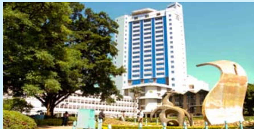
The University of Nairobi Towers at the Main Campus

Association of Business Studies Students (ABSS) E-Mail: absskikuyu@yahoo.com