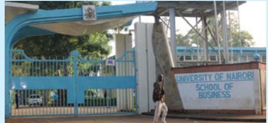
School of Business (Lower Kabete Campus)