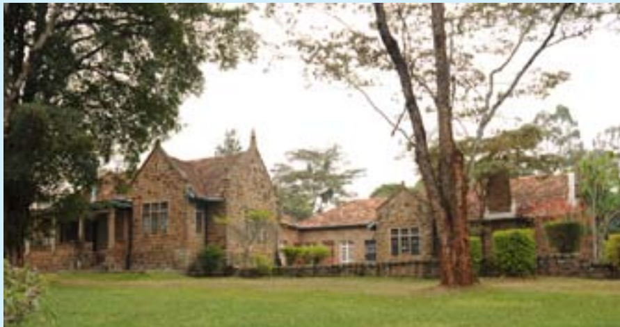
Grogon house a protected colonial monument under the care of the University of Nairobi Chiromo Campus