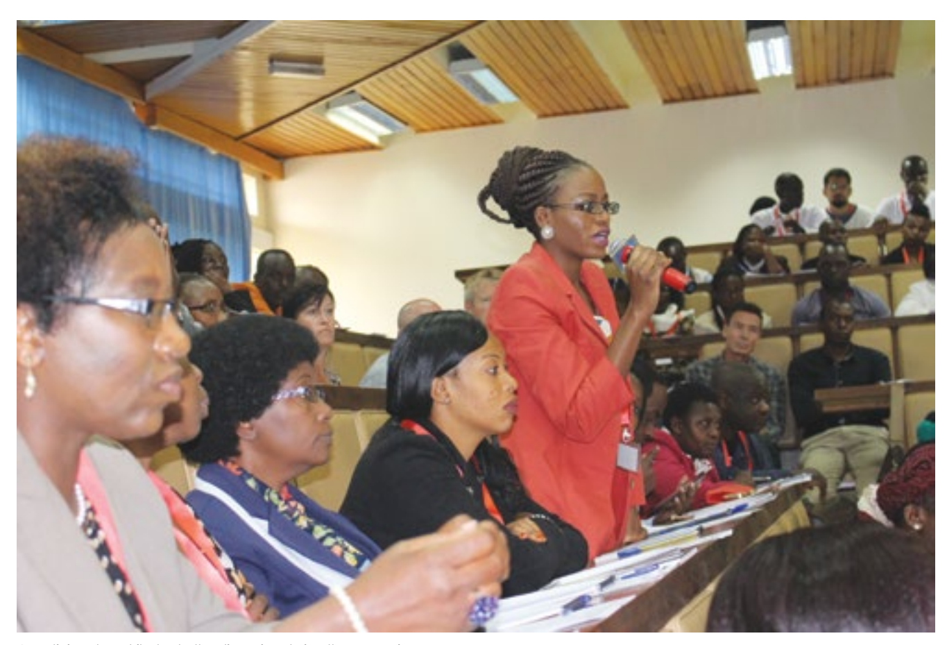
A participant contributes to the discussion during the symposium.