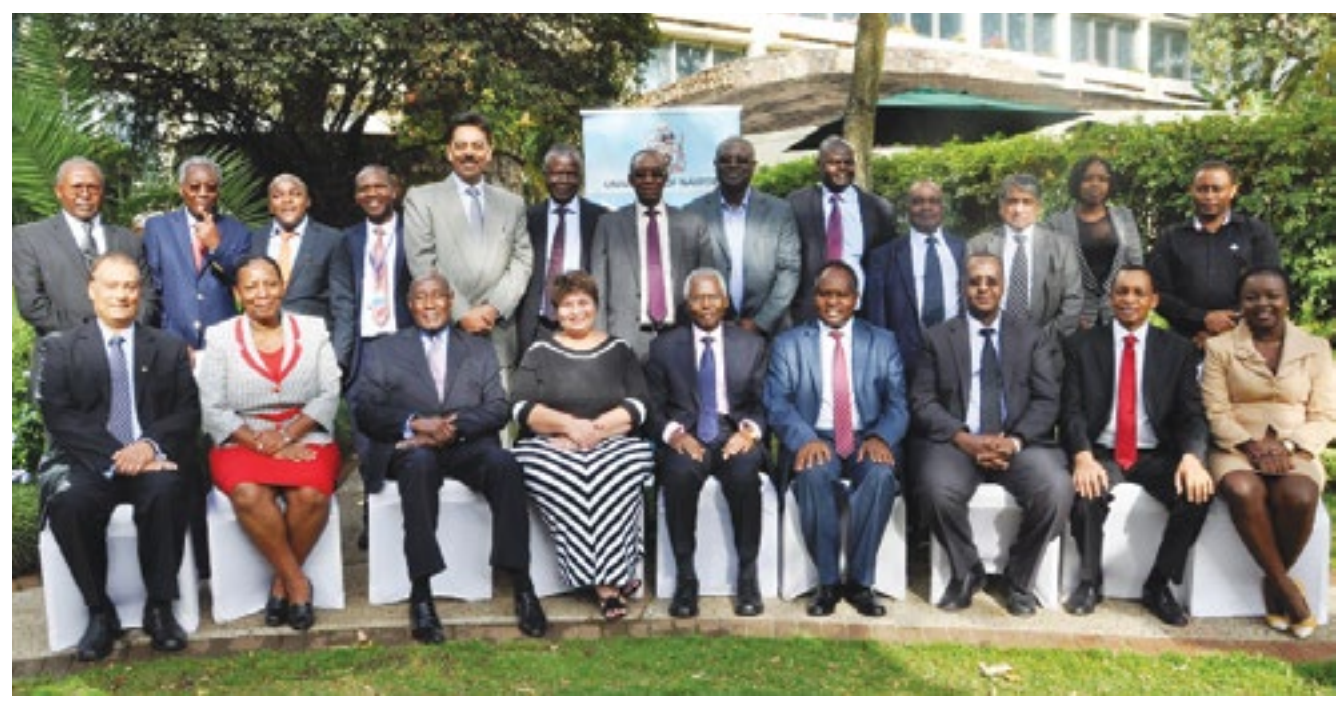
Stakeholders at the launch of the UoN Endowment Fund.

The objective of the Endowment Fund Campaign is to ensure that no qualified student is ever turned away because of financial need, that UON continues to attract the best and brightest students and to enhance the image and reputation of the University.