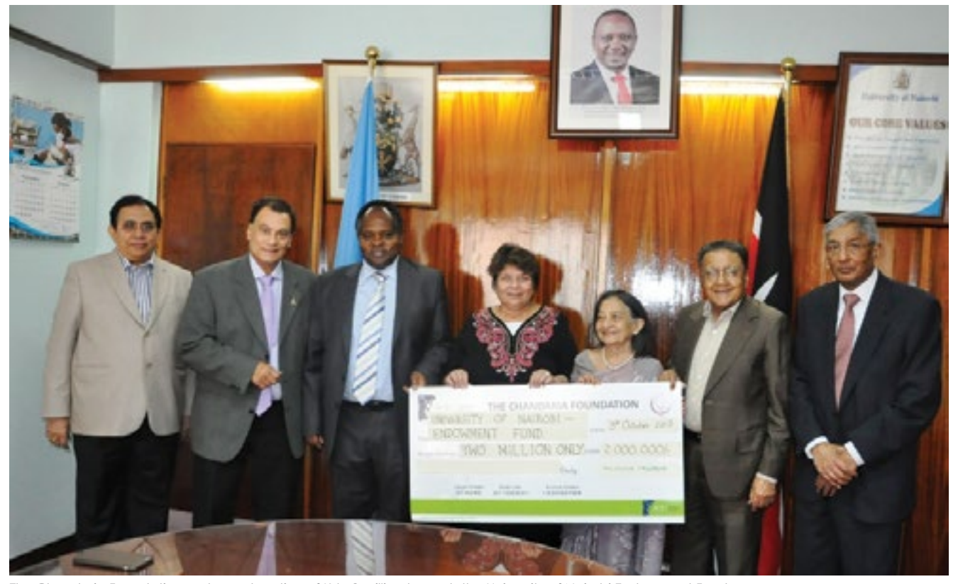
The Chandaria Foundation makes a donation of Ksh. 2 million towards the University of Nairobi Endowment Fund.