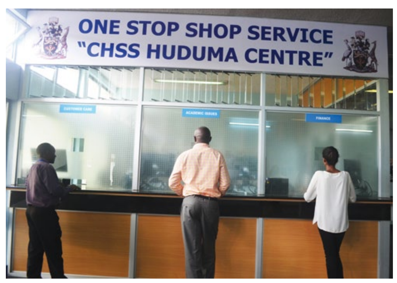
Clients being served at the newly set up CHSS Huduma Centre.