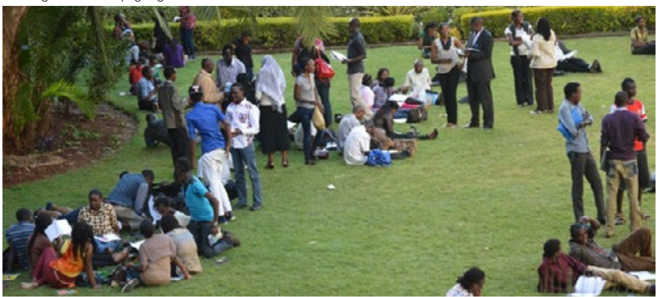
Student members of AIESEC hold consultations on campus next to Taifa Hall.

The greatest virtues I learned were patience and resilience. Going for exchange is the best decision I have made yet and it gets you on a road to self-discovery like no other. So get out of your comfort zone, visit our AIESEC office and get the experience of your lifetime!!