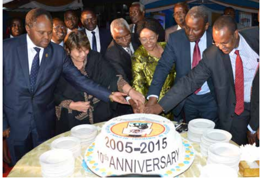
Guests and university management cutting the 10th Alumni anniversary commemoration cake.