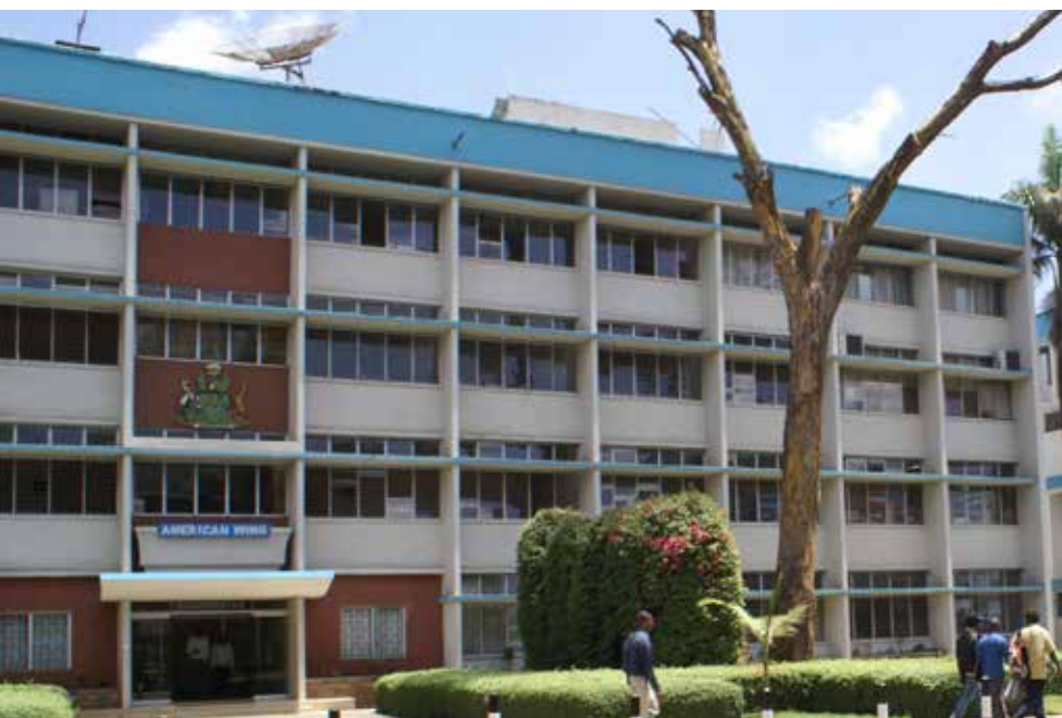
The American Wing, one of the buildings housing activities of the School Engineering.

The project with the University of Nairobi is one of the 59 projects that will pair African Diaspora