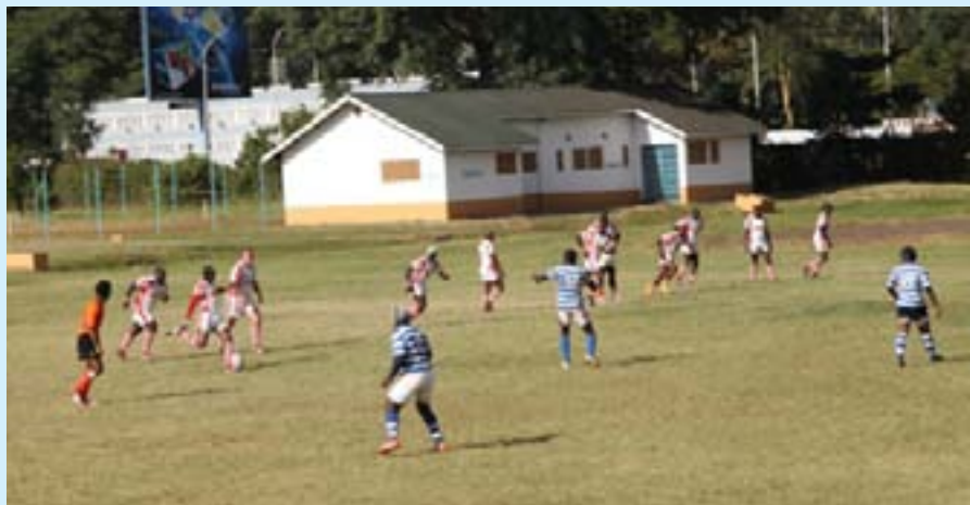
The Mean-Machine University of Nairobi Rugby Team

Basketball men and women always qualify among the top 4 teams in the country that participate in the playoffs for the last 7 years. Mean Machine was the flood light champion in 2006 and runners up in Enterprise Cap in 2007, a league that attracts top clubs in East Africa. Mean Machine has also won 2 Gold Medals and 2 Bronze Medals in the last 3 East African Interuniversity Games editions.