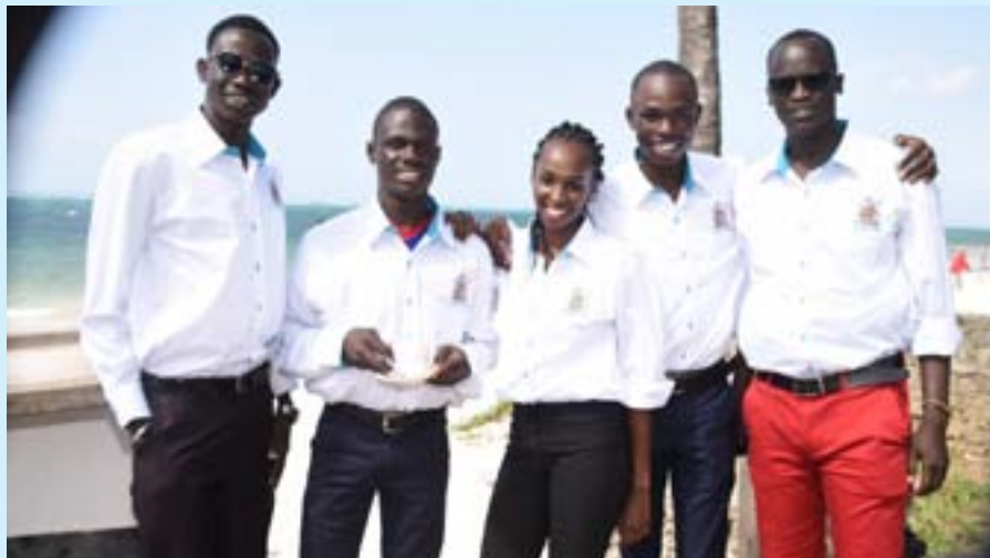
A section of the 2019 Students Organization Leaders (UNSA)

Students are encouraged to participate in extra-curricular activities while at the University. One such outlet is participation in professional associations and clubs. These associations not only address the professional and personal welfare interests of students, but they also provide opportunities for performing community service and personal development. The University has various students bodies, which represent students' interests. Through the various representatives, students access all decision-making levels from the halls, the Senate, and all the way to Council. The University of Nairobi is committed to seeing that student organizations are fiscally able to meet their desired goals and aims. Student Organizations should liaise with Deans of Faculties and Directors of Institutes for further guidance.