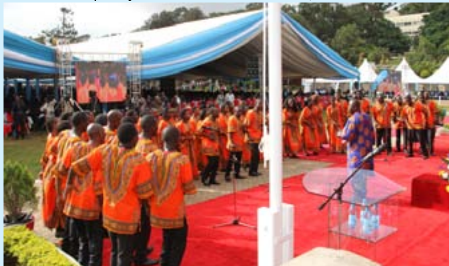
University of Nairobi choir performing during the 56th Graduation Ceremony

Habitat for Humanity Kenya - University of Nairobi Campus Chapter Hindu Students Association Historical Association of Kenya Human Resources Management Students Association Inter-College Environmental Network International Relief Friendship Foundation (IRFF) Japan-Kenya Student Conference of Nairobi Kenya Law Students' Society Kikuyu Kiswahili Club (CHAKIKU) Lafreme - Medical Campus Linguistics Student Society Lions Club of the University of Nairobi Literature Students Association Marketing Students Association Mathematics Association of Nairobi University (MANU) Medical Students Against AIDS Muslim Students Association-E-Mail: msa_un@yahoo.com Nairobi University Actuarial Students Association Nairobi University Agriculture Students Association Nairobi University Association for a Drug Free Society -(NUADS 72 Nairobi University Biochemistry Students Association (NUBSA) Nairobi University Chemical Club Nairobi University Collegiate Association for Research of Principle Nairobi University Computer Science Students Association (NUCOMMSA)