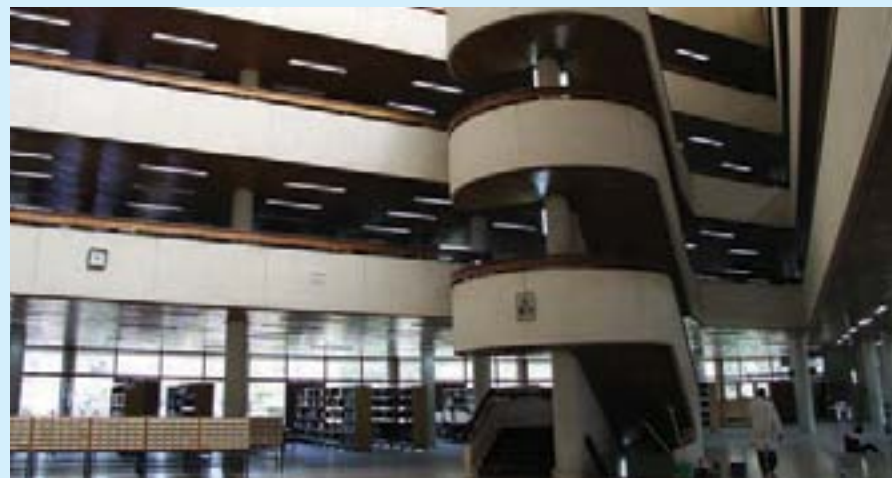
An inside view of JKML Library

The library is open to members of the University Community (students and staff). Non-university members with recognized study and research needs may also be admitted. Admission is by University identity card.