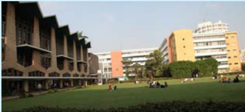
A view of the University of Nairobi Main Campus

Nairobi enjoys a temperate climate. The hottest periods, however, occur between January and March and August and October with the coolest period in July. The long rains fall from the end of March to the end of May while the short rains are experienced from the end of October to December. The average annual rainfall is about 800 centimetres. Nairobi is the capital city and the commercial, administrative and cultural centre of Kenya. In Nairobi are found the Parliament Buildings, Headquarters of Government Ministries and Departments. Also, the city is home to the City Hall, State House, National Museums of Kenya, Snake Park, the Arboretum, The Animal Orphanage, churches of various denominations, Mosques, Hospitals, Markets, Art Galleries, Kenyatta International Conference Centre (which houses one of the largest Conference Halls in the world), cinemas, numerous hotels, restaurants, entertainment centres and even a game park. Transportation around Nairobi and its environs is easily available.