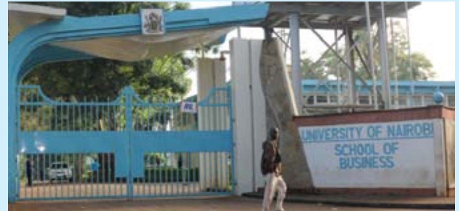
School of Business (Lower Kabete Campus)