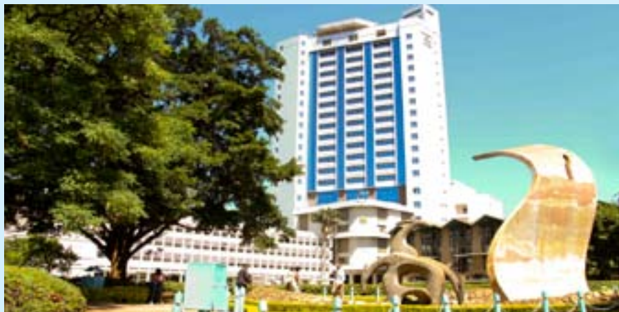
The University of Nairobi Towers at the Main Campus

Accounting Students Association AIESEC Kenya - Commerce. E-Mail: kenya@aisec.net Africa Peace of U.O.N. Chapter Agricultural Economics Students Association Agricultural Education and Extension Students Association Arabic Students Association of Nairobi University Archaeology Student Association Architecture Students Association Association of Architectural Students Association of Banking Students Association of Business Studies Students (ABSS) E-Mail: absskikuyu@yahoo.com