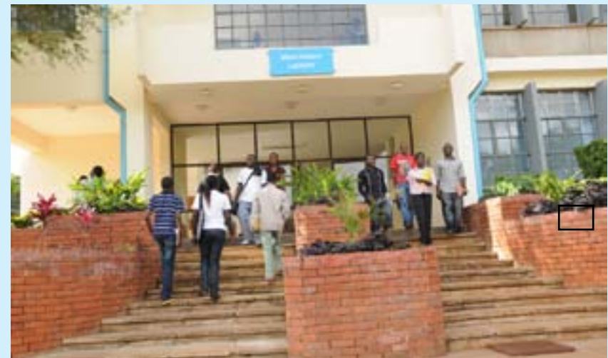
The Mwai Kibaki Library at the Lower Kabete Campus