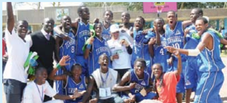
University of Nairobi Basketball Team