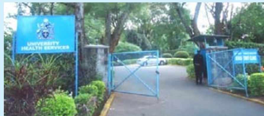
The entrance to the University of Nairobi Health Services Clinic along State House Road

The maternity care provided will exclude delivery, pregnancy related complications and services received from private facilities.