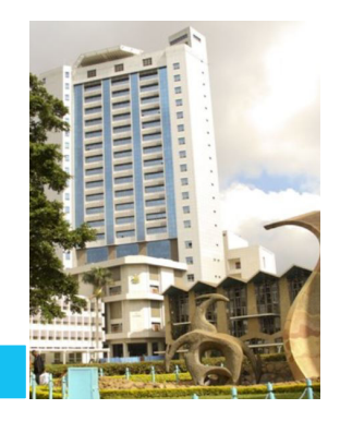
July - August 2021