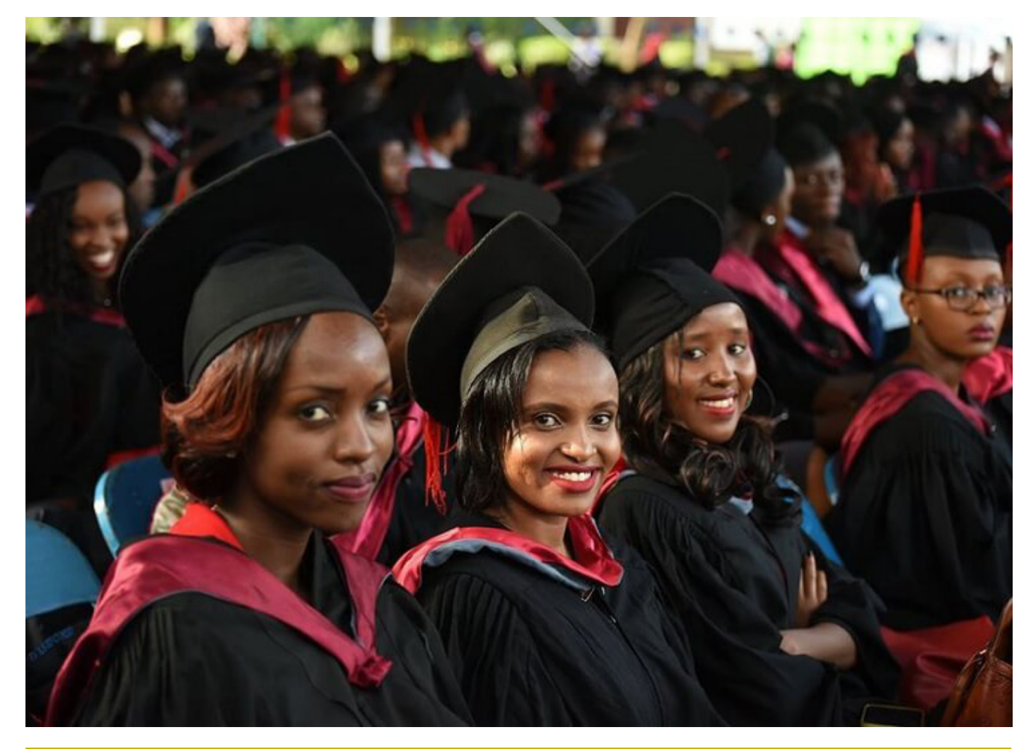
UoN Graduands during a past graduation ceremony