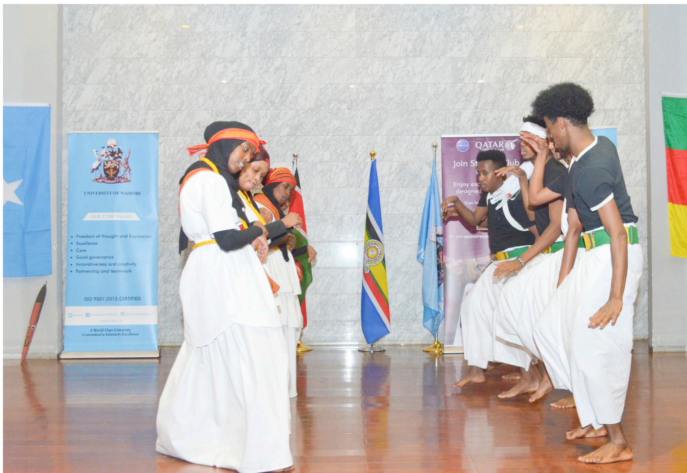
Students from Somalia showcase their dance routine during the International Student Day celebrations

The University of Nairobi held its first ever International Students day themed, 'Cultural developments and interactions.' The international students day was highly significant given that UoN is home to around 2,000 international students representing nationalities from over 40 countries mostly from neighboring countries like Somalia, Southern Sudan, Uganda and Tanzania. The inaugural celebrations provided a platform for students to celebrate and appreciate their diversity and culture.