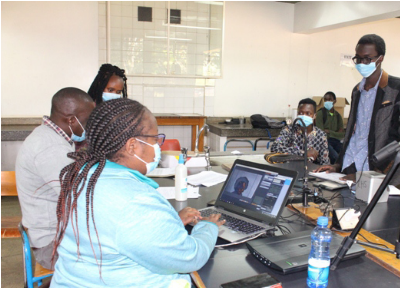
First year student undertakes Biometric registration upon reporting for studies

F irst year Students admitted to the University of Nairobi reported for on campus learning on September 20, 2021 and immediately began the registration process. Importantly the University had integrated Student Management Information System with the registration and Biometric system to ensure effective