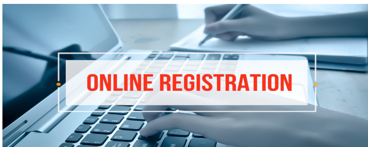
First year student undertakes Biometric registration upon reporting for studies

and efficient registration process. The students also provided scanned copies of filled Joining instructions during the process of capturing biometric information. The registration and biometric exercise was open for all new students for a period of four (4) weeks. Course registration on SMIS also commenced for the students who have paid their fees in full. An allowance of five (5) weeks is given for course registration.