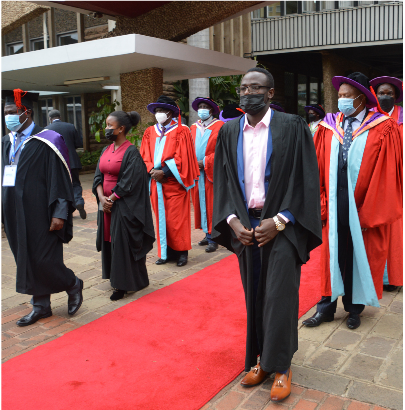
The Academic Procession making its way to the Great Court