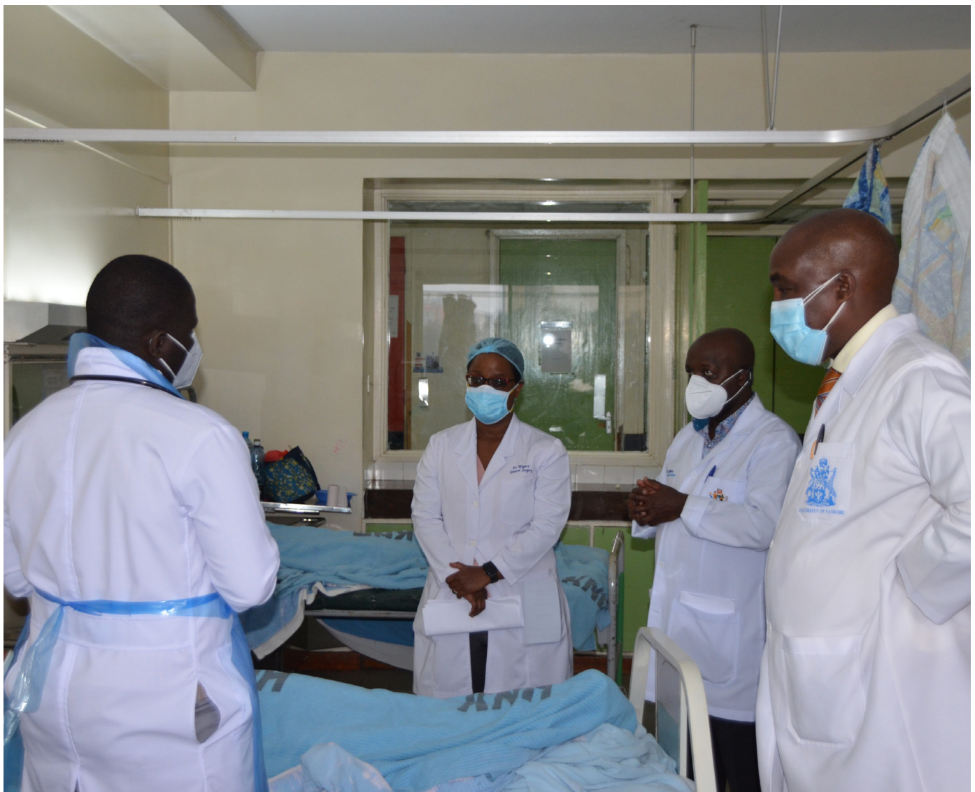
Final year MMed clinical examination at UoN teaching hospital. First Year Science based students report for practicals on 9th November, 2020