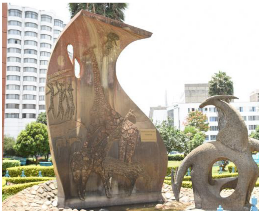
Fountain of Knowledge