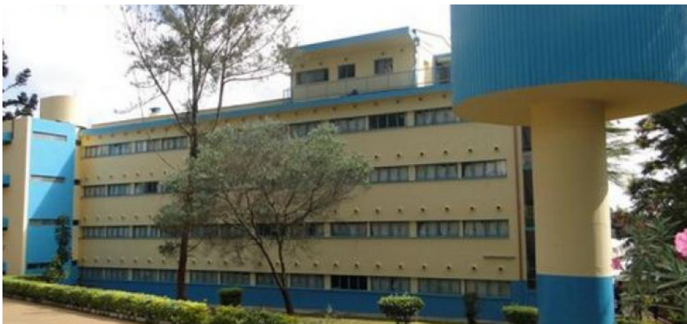
UoN Hall of Residence Reinovated