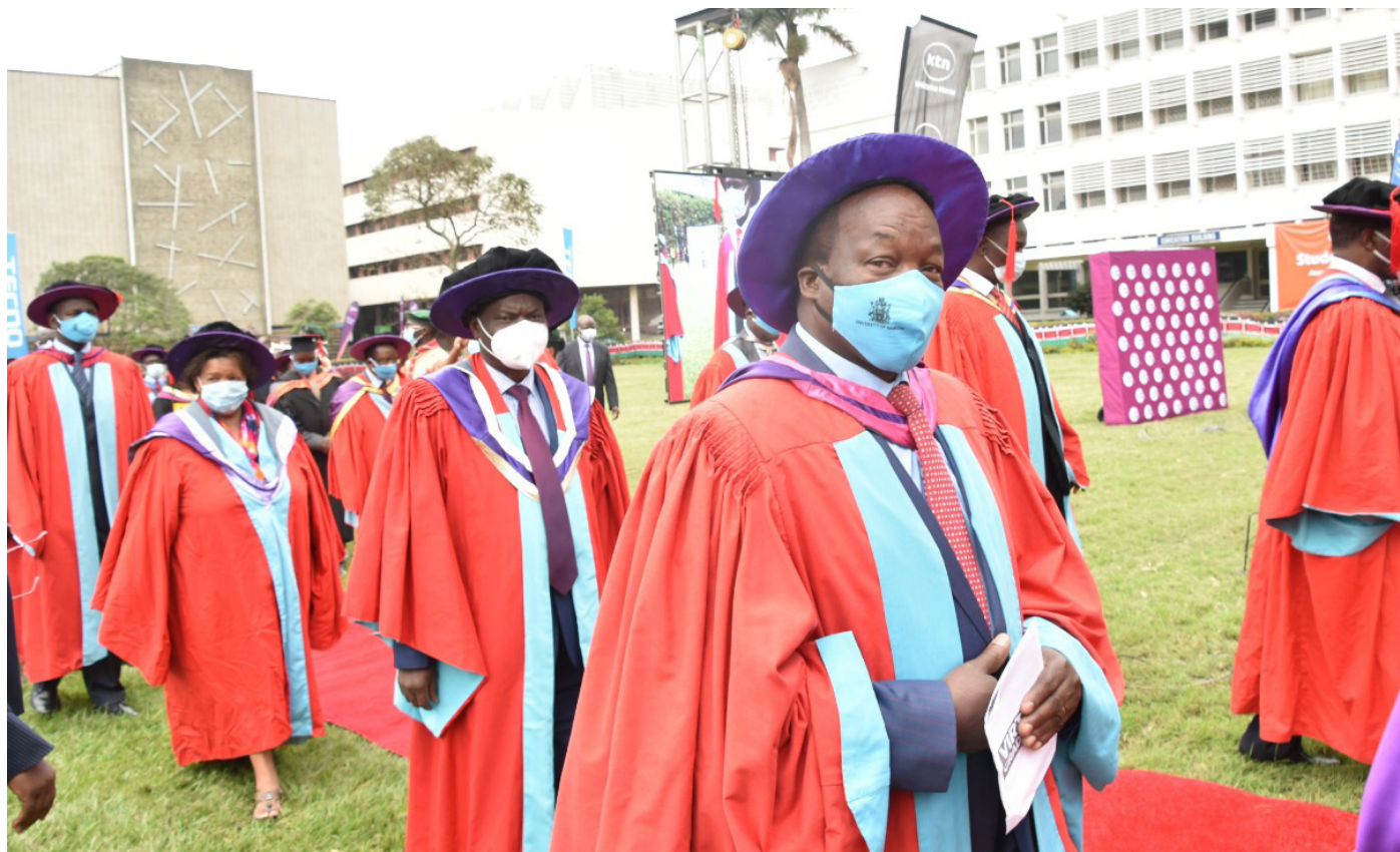
University of Nairobi Dons during the Academic Procession in strict adherence to Ministry of Health Guidelines on Social Distancing and Face Masks

T he 63rd University of Nairobi Graduation Ceremony deviated from the usual trends. Though expected, with the world fighting the COVID 19 global pandemic, the University of Nairobi grounded on a foundation of adaptability in these changing times ensured continuity of operations in strict adherence to