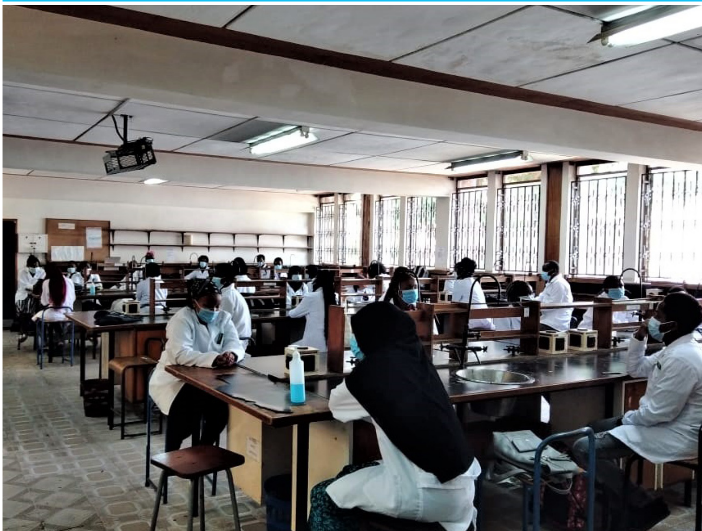
University of Nairobi School of Pharmacy Students prepare for a practical session at the KNH Campus. The School emphasized strict adherence to Ministry of Health Guidelines on Covid 19 containment measures.

T he University of Nairobi resumed face to face learning for first year students the Colleges of Agriculture & Veterinary Sciences, Architecture & Engineering, Biological & Physical Sciences, Education & External Studies (Kenya Science Campus) and Health Sciences on 9th November, 2020 for their practical sessions. The University put in place strict procedures in compliance with Government of Kenya and Ministry of Health Guidelines and protocols for containment of Covid-19. Each College ensured availability of Hand Washing areas, Sanitizers, Temperature Taking guns at entry points and strict Social and Physical Distancing during practical sessions within the University Laboratories and Studios.