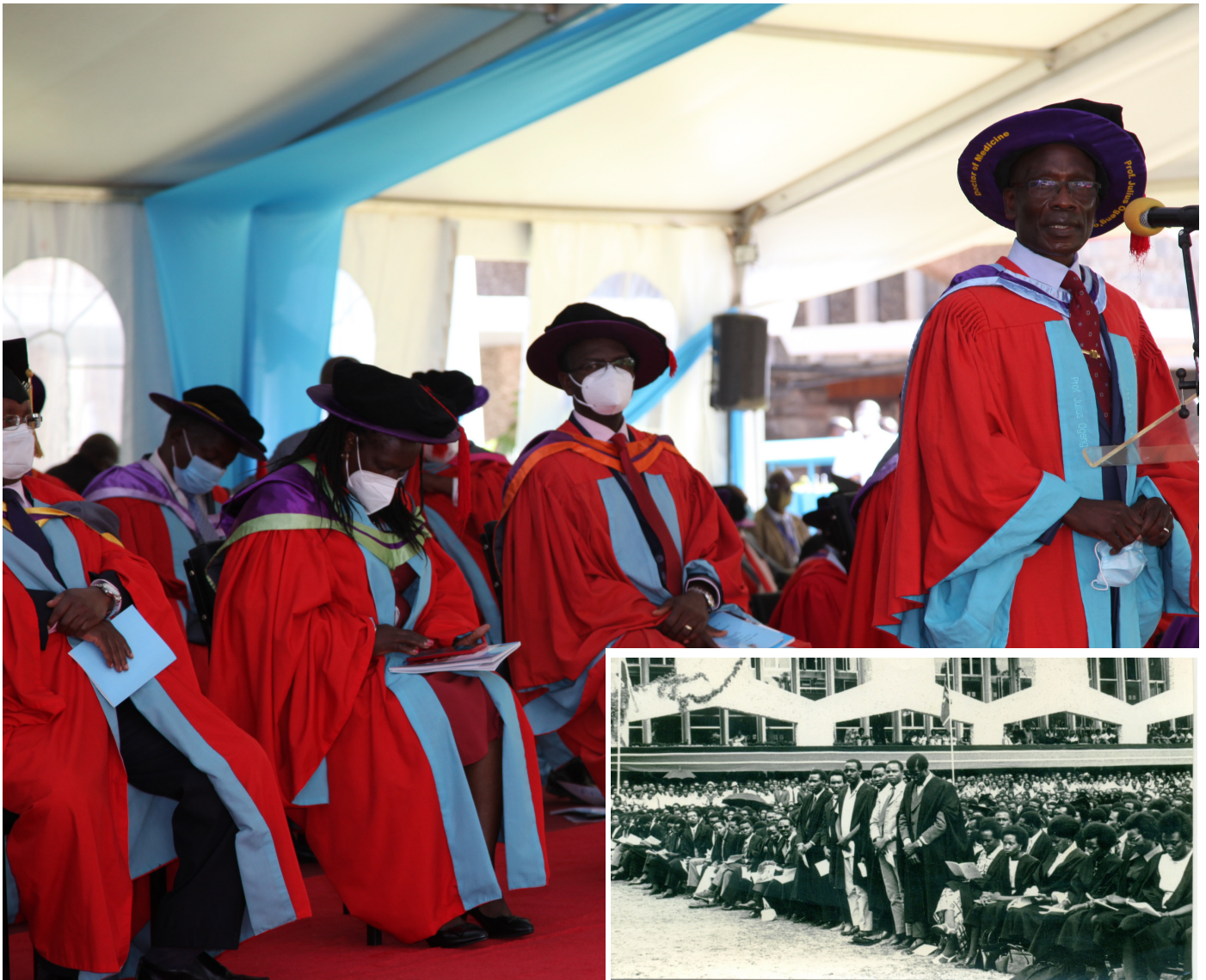
The 64th UoN Graduation Ceremony at the Great Court transmitted virtually. Inset: the inaugural UoN Graduation Ceremony at the Great Court on 11th December, 1970

The University of Nairobi Great Court was the setting for the 64th Graduation Ceremony held on 11th December, 2020 marking exactly 50 years since the 1st Graduation ceremony was held on the same grounds. The 64th Congregation was held virtually and saw some 5, 709 conferred various degrees and awarded various Diplomas. Five decades later from the inaugural ceremony, the University has embraced technology and successfully carried out the online graduation ceremony. The 64th Graduation also conferred honorary Degrees- Doctor of Letters of the University of Nairobi, to UoN Council Chairperson Prof.