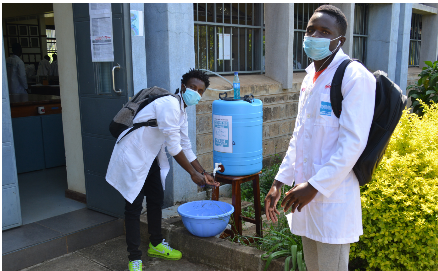
University of Nairobi Kenya Science Campus students observe the Ministry of Health Guidelines on Covid 19 containment measures as they attend a practical lesson at the Campus

On accommodation, Halls Officers were on hand to give guidance on New Accommodation Procedures set in accordance with Ministry of Health guidelines and protocols for containment of Covid 19 for all students residing in the Campus.