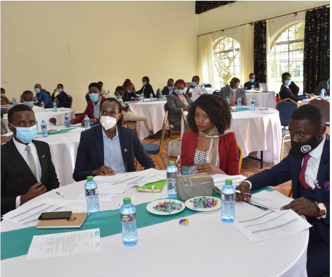
Participants Keenly following one of the training sessions