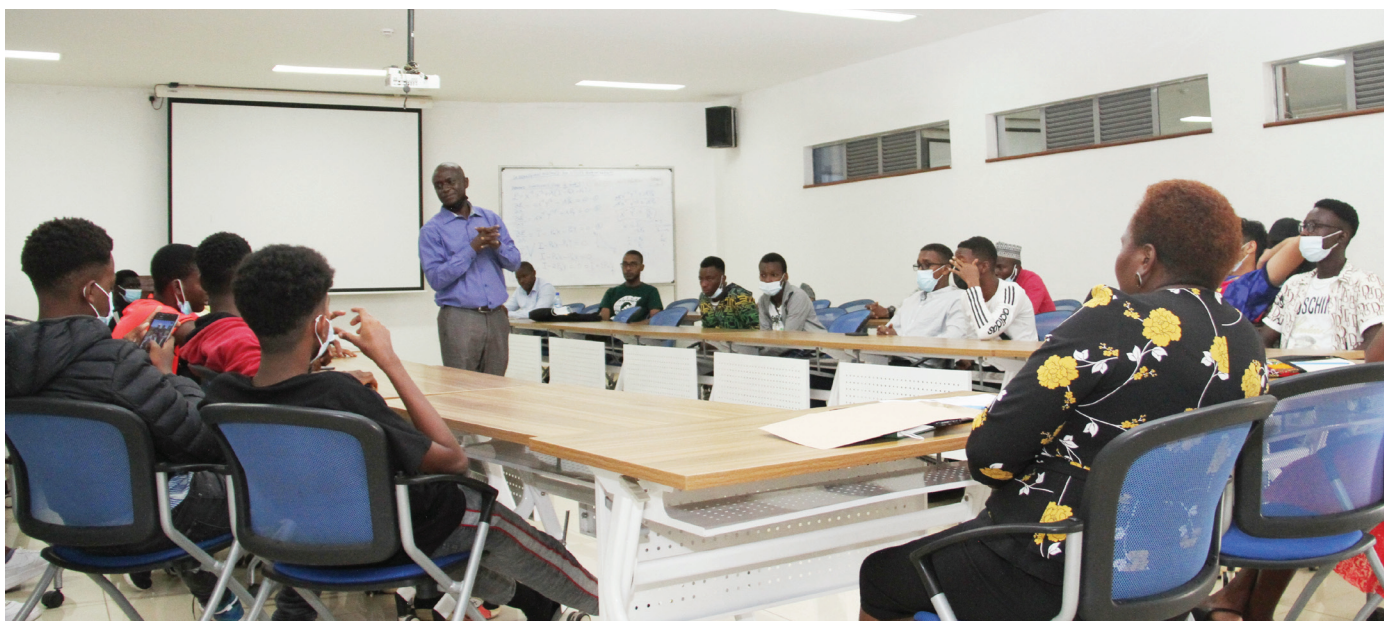
Staff of the Admission and Dean of Students Office taking the students through Career talk during their visit to the University.