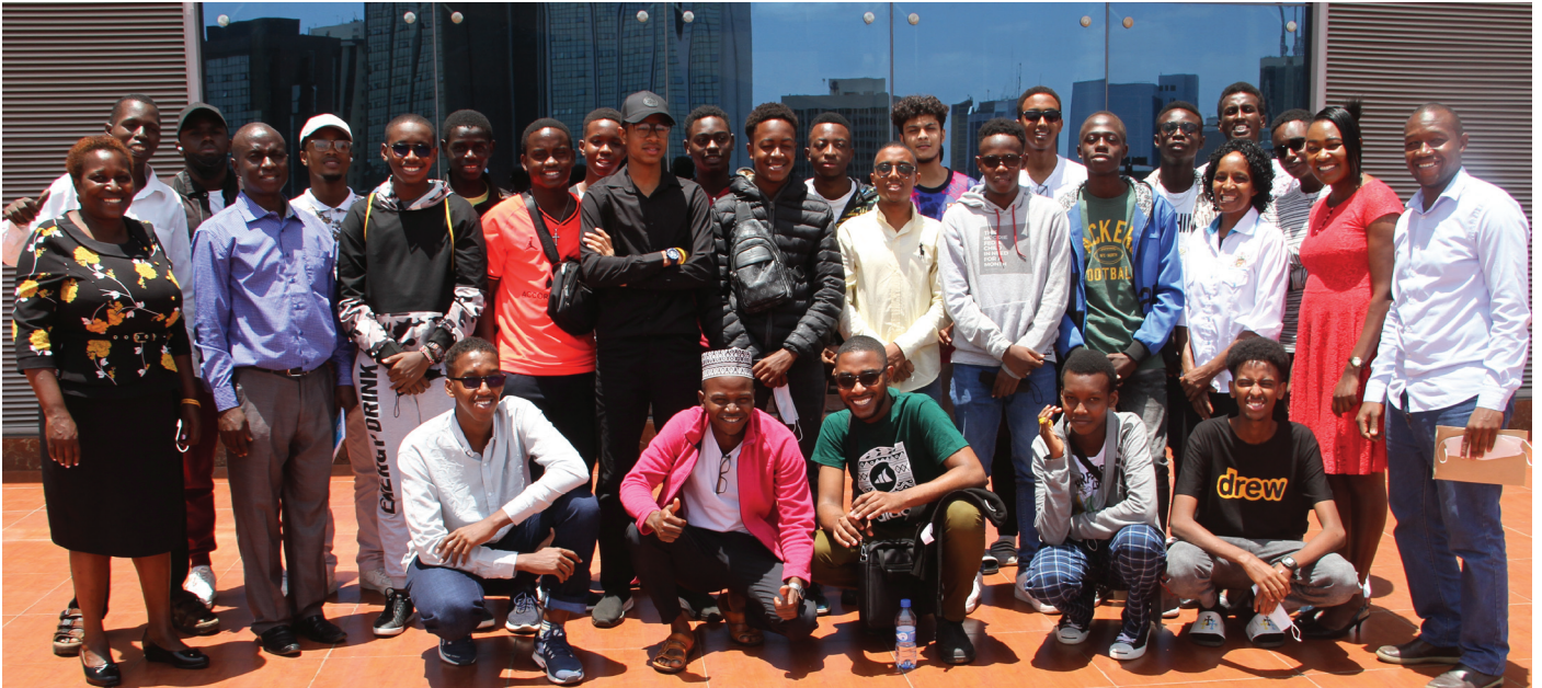
Students of Light Academy Mombasa pose for a photo with University staff from the Dean of Students and Admissions when their visited the institution on 8th March 2022

T he University of Nairobi welcomed students from Light Academy Mombasa. The Students visited the University and were taken through Career choice, Career Paths, Programmes available at the University of Nairobi, subjects and cluster point for UoN flagship programmes and extra-curricular activities available at UoN. The team was received by the Career Office in the Dean of Students Office and Admissions team. The students had a chance to experience first-hand the warmth of staff at the University, the impeccable facilities and state of the art learning equipment at the University.