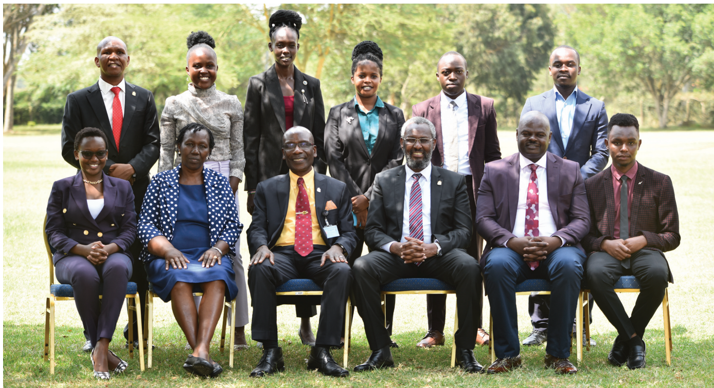
Group photo of UoN Management and UNSA Student Council

The workshop was organized into four sessions. The first two sessions, comprising presentation on several topics, related to the University structure and services offered by various departments. The third session was a breakout session where various Deans of Faculties and Director of Campuses met with their respective Faculty/Campus leaders, while the Student Council had a session with Central Heads of units. The final session was an interactive plenary of presentation by various teams and question and answer segment. The Vice Chancellor during his address, reminded the student leaders that they had a great role to play in protecting UoN brand on behalf of other students for now and in the future.