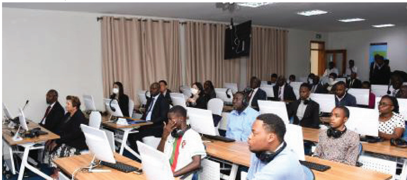
The Launch of SMART Classroom